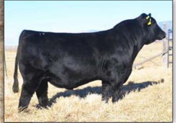
THSF LOVER BOY B33 - Sire of Lot 14