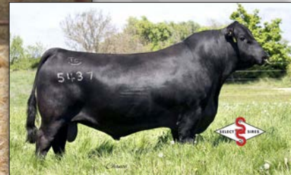
TEX Playbook 5437 - Sire of Lot 3