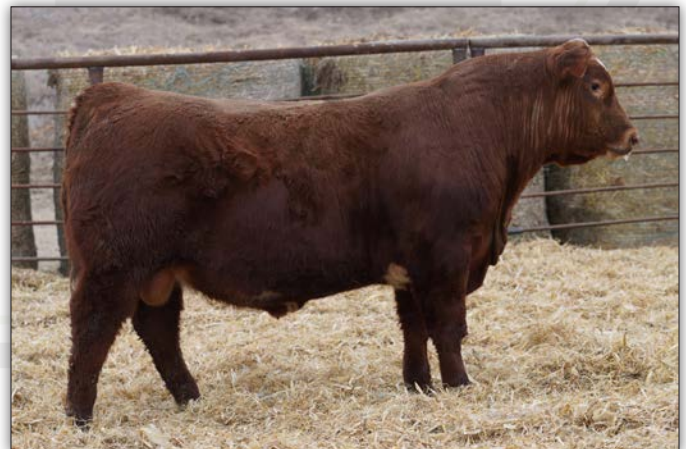
BET ON RED N506 - Lot 20

• This red bull is super cool. He'll leave extremely eye appealing cattle with Excellent performance. His grandmother is a powerful 2018 born cow in our herd as well. If you come to the sale set on black bulls this one may have you double thinking when you see him.