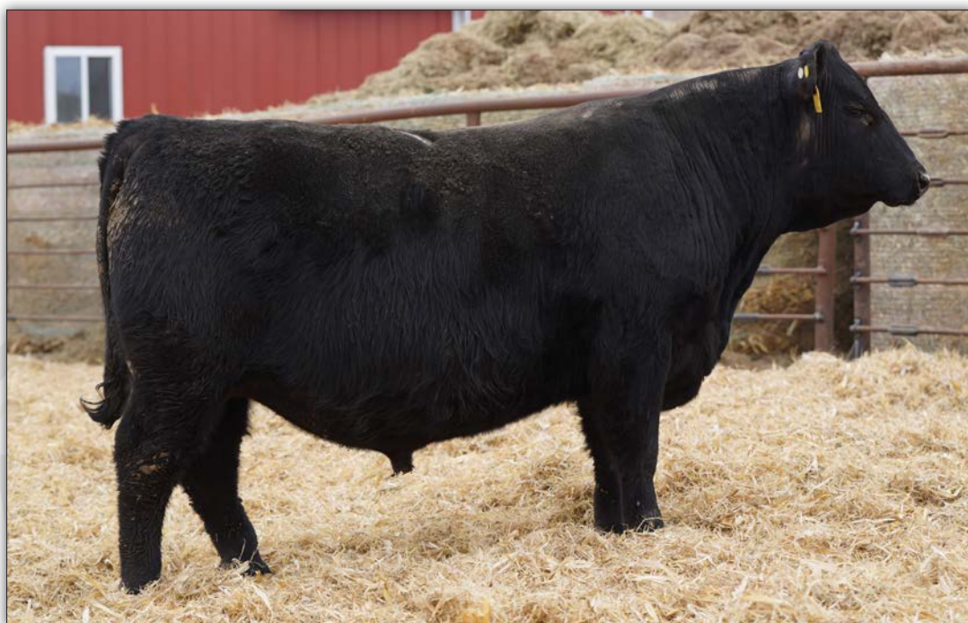
WGCC Exponential 5005 - Lot 9