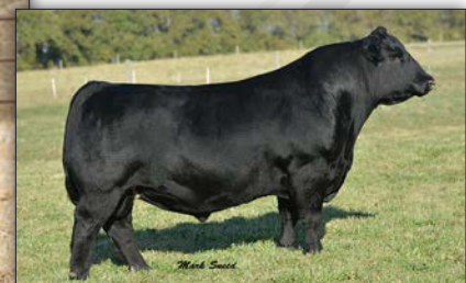
PVF Insight 0129 - Sire of Lot 4