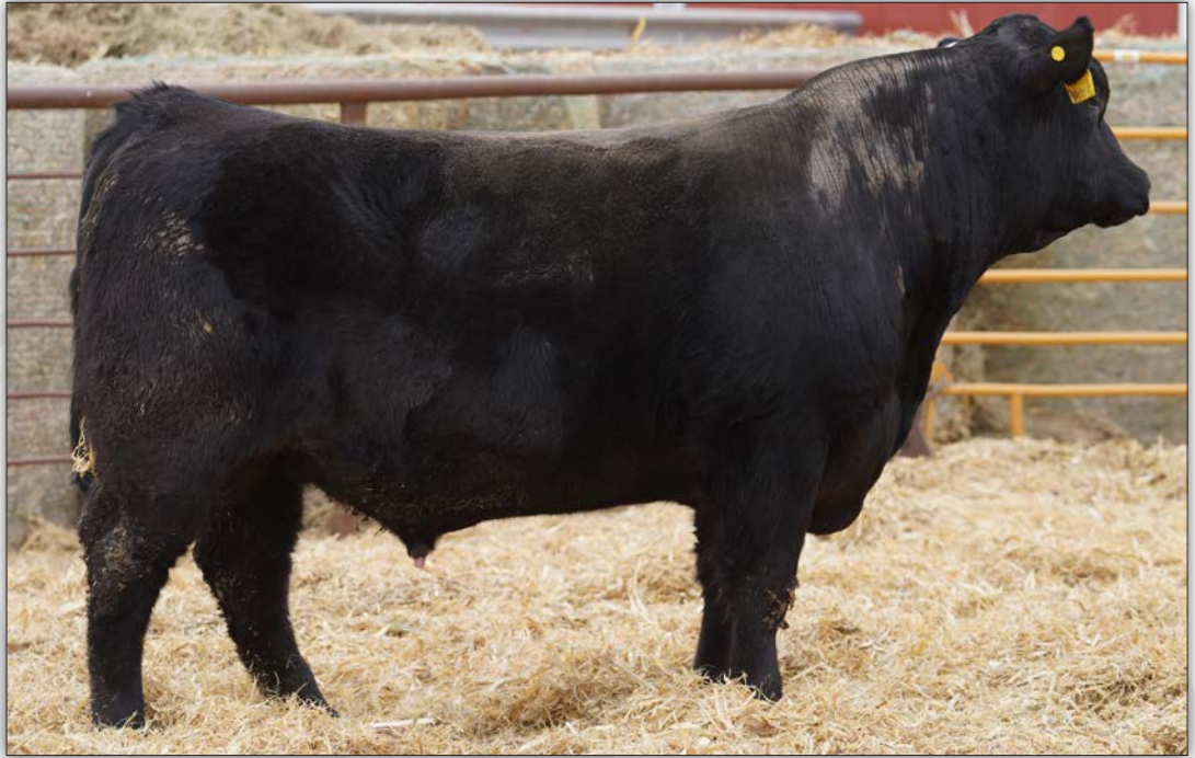
WGCO GENESIS M487 - Lot 16

• Excellent maternal genetics behind M487. He's out of our herd bull we purchased from Ruby Cattle Co for his excellent combination of performance, carcass ratios, and excellent cow family. His dam is about as perfect of a 7-year-old cow you could ask for, and looks to have the makeup for longevity as well.