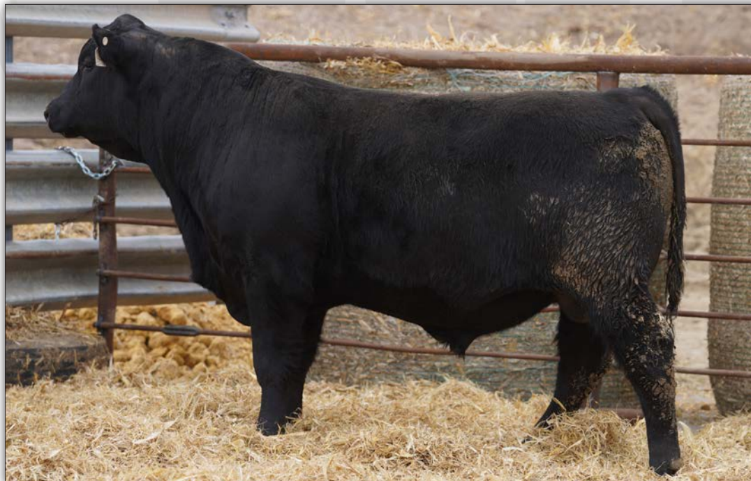
WGCC El Guapo 4070 - Lot 2

• Like lot 1 with little more performance and great maternal genetics on the bottom side of the pedigree. He's an outstanding combination of performance and maternal genetics. Out of an excellent cow family. His mother's last heifer calf sells bred as lot 25.