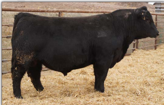
WGCO RED HILL M443 - Lot 13