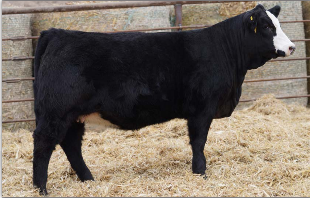
WGCO RHYTHM N516 - Lot 30