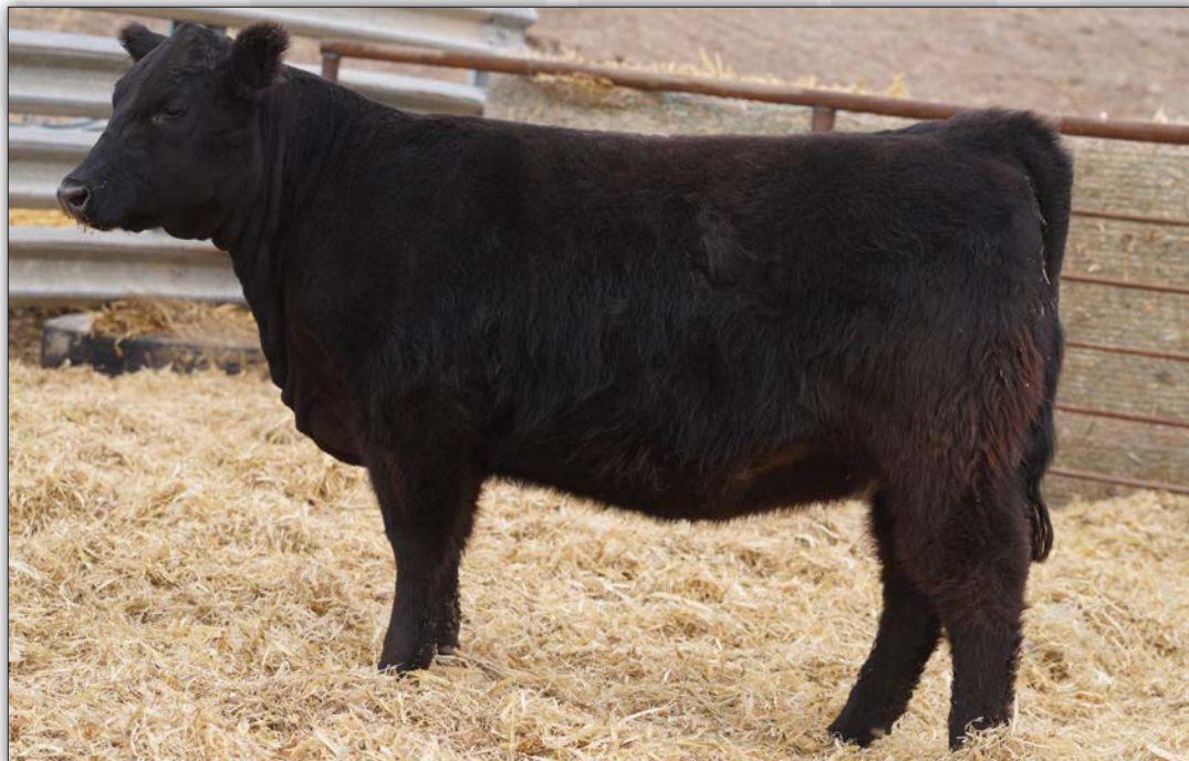
WGCC Ellie 5007 - Lot 29