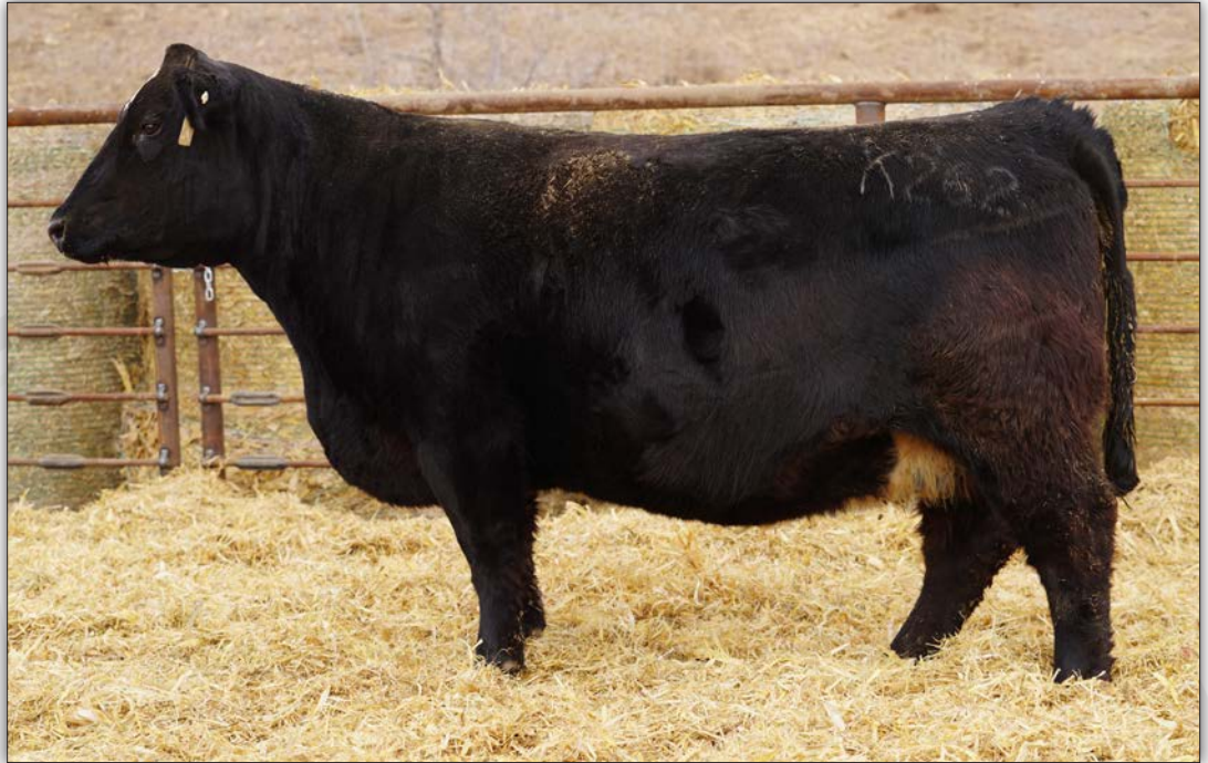
WGCO NEW EDITION K262 - Lot 28