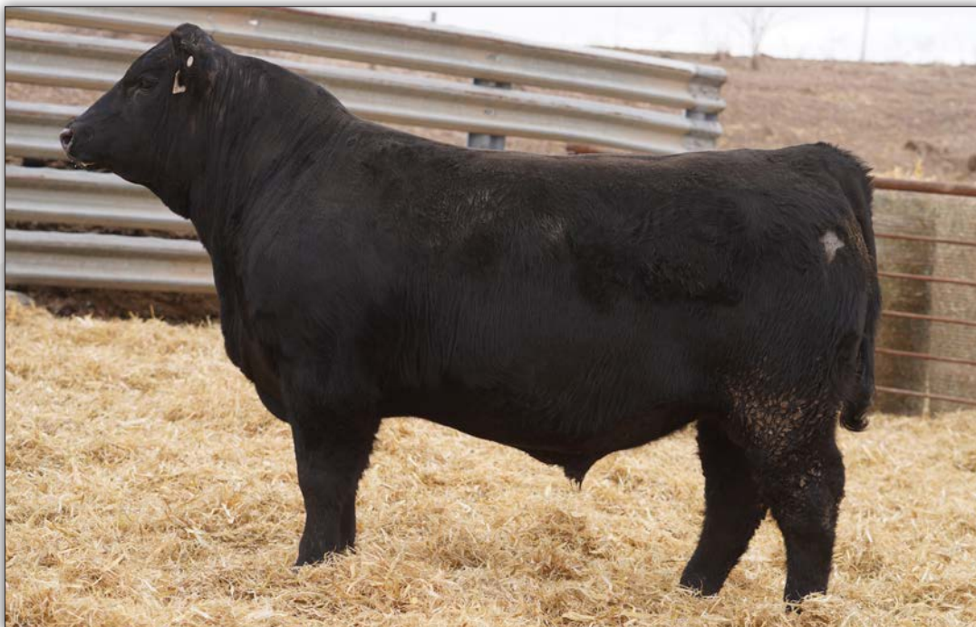
WGCC El Guapo 4040 - Lot 1

• We're excited about this year's lineup, so I didn't know where to start with our catalog order. We went with 2 El Guapo sons and a Tex Playbook out of his mother for lots 1-3. El Guapo 1016 was our top selling bull in our 2023 sale. Nothing in extreme and everything in proportion describes him as having no holes in everything we look for in good cattle, and comes from an outstanding 2014 born highly productive cow we purchased from the TC Ranch in Franklin, NE. Lot 1 is a cool looking rascal and out the dam of our lot 1 bull from our 2025 sale. She's another high performing 10 yr old TC Cow. I would describe this bull with consistent performance with an excellent phenotype.