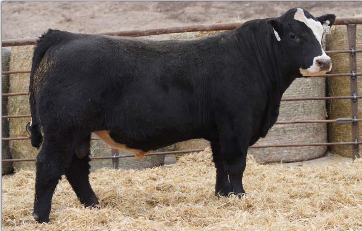
WGCO COWBOY LOGIC M432 - Lot 12

• I heard once that a bull's mother keeps popping up in the offspring of his calves. If that's the case, we shouldn't be selling this bull. I can't say enough about his mother who will be 14 next month with another great bull calf at her side. She is a commercial angus out of Conneally Final Product and catches your eye from a distance every time you walk into the pasture. Outstanding combo of performance and maternal with this bull.