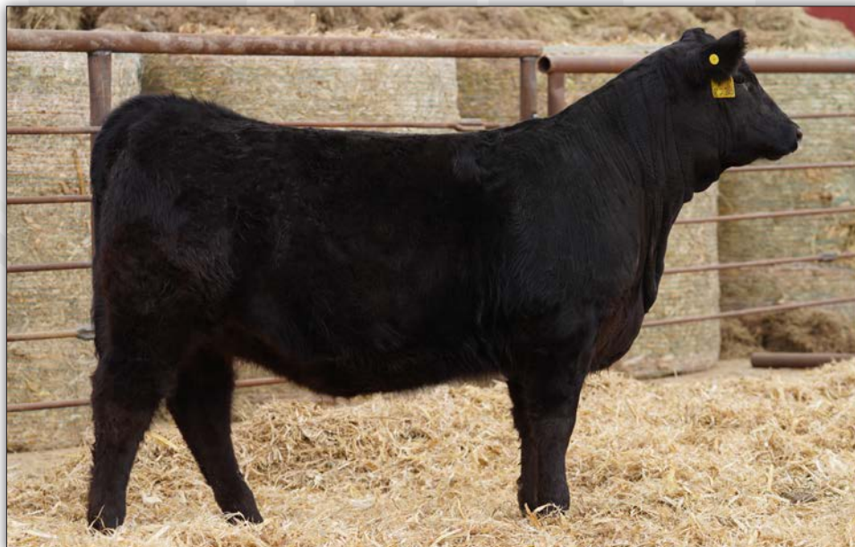
WGCO BLACK BIRD N527 - Lot 31