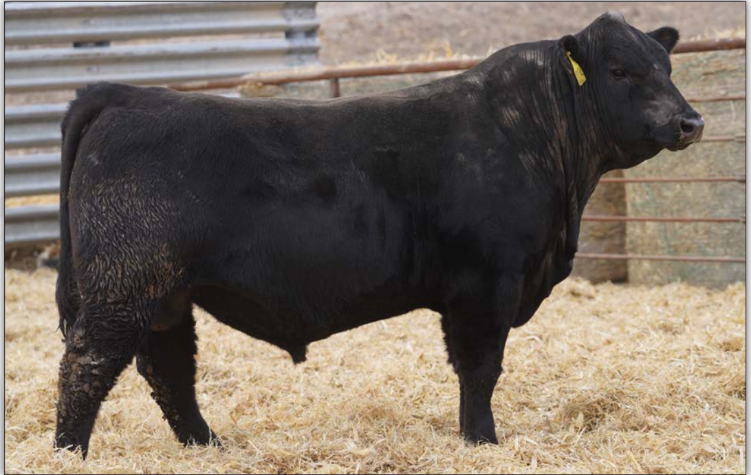
WGCC Thunder 4041 - Lot 5

• This bull is out of an excellent young cow loaded with a great maternal pedigree. His sire TC Thunder 2519 is highly proven to us. We purchased him in 2014, used him heavily in our commercial heifer projects, and he keeps giving us great ones. He's out of TC Aberdeen's Mother and should get used more often. 4041 should give an excellent combination of performance and maternal strength in his calves.