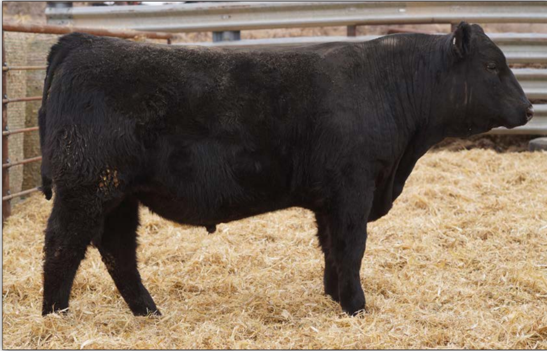
WGCO MISS LOVER BOY N509 - Lot 21