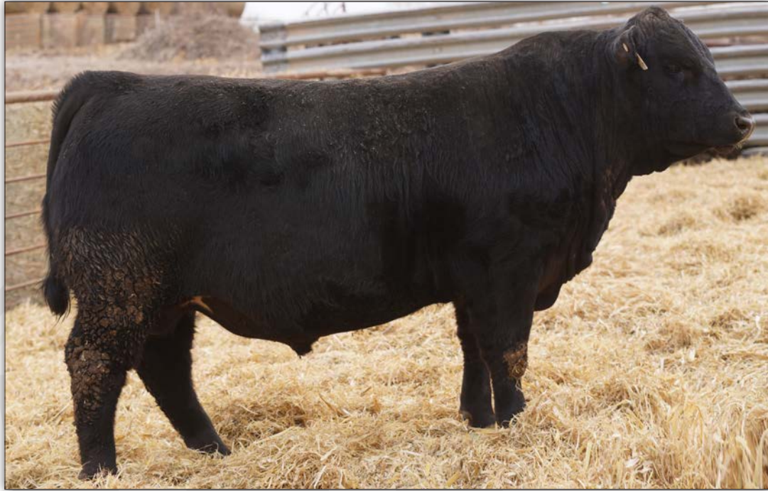
WGCO COWBOY LOGIC M478 - Lot 18