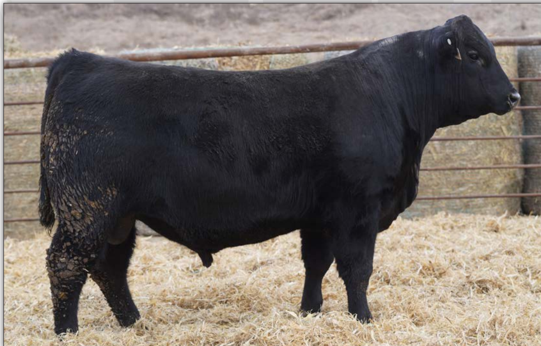
WGCC Southern Charm 4039 - Lot 6

• This bull is awesome, and maybe should have been lot 1, he's exactly what we strive to breed. He come's from an outstanding cow family. His dam is a never miss Broken Bow daughter out of pathfinder dam from the TC Ranch herd. Sired by Southern Charm who we love for his unique combination of elite maternal, performance, and carcass traits. If the saying is true that you replicate great cows through their son's, we should have kept this one for a herd bull. His mother's last heifer calf sells bred as lot 24, you'll love them both on sale day.