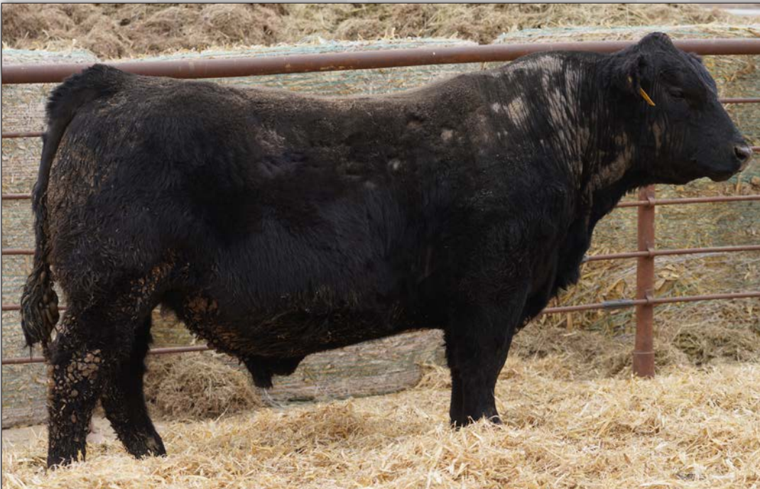
WGCO RED HILL M438 - Lot 17

• Another 231A out of one of my favorite power cows in the herd. She's larger framed with very correct feet, an excellent udder, and is sired by Leachman Prophet who's calves have excelled on the grid for us over the years. The epd's say average on carcass but the pedigree and track record would say otherwise. Tons of power with some great maternal as well.